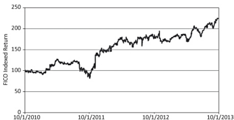
FICO 3-Year Indexed Total Shareholder Return

From the perspective of our stockholders, however, fiscal 2013 was a good year with continued strong returns as illustrated by the chart below.