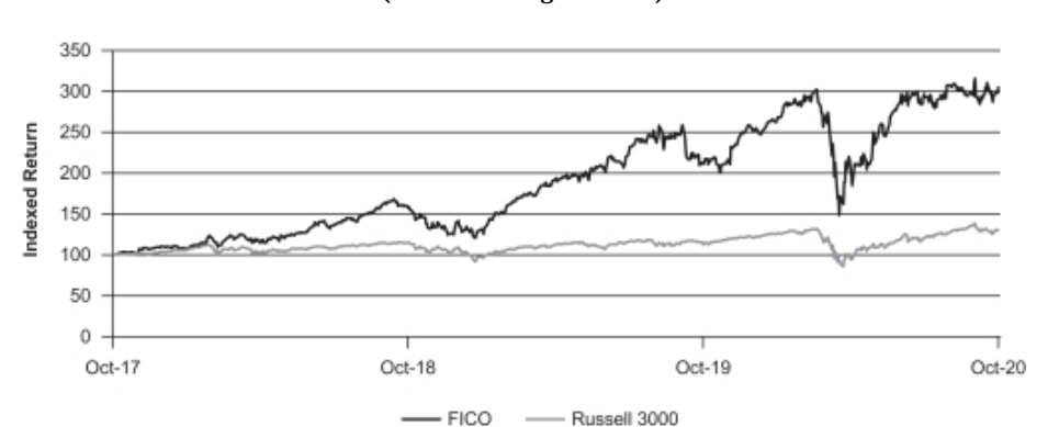
FICO vs. Russell 3000 3-Year Indexed Total Stockholder Return (10/1/17 through 10/1/20)

Fiscal 2020 was also a good year from the perspective of our stockholders, with continued strong returns illustrated by the chart below for the past three fiscal years.