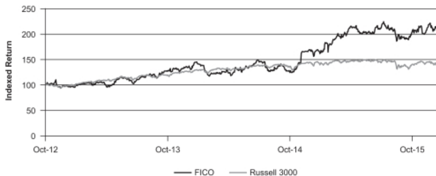
FICO vs. Russell 3000 3-Year Indexed Total Shareholder Return (10/1/12 through 12/31/15)

Fiscal 2015 was also a good year from the perspective of our stockholders, with continued strong returns illustrated by the chart below for the past three fiscal years and the period from October 1, 2015 through December 31, 2015.